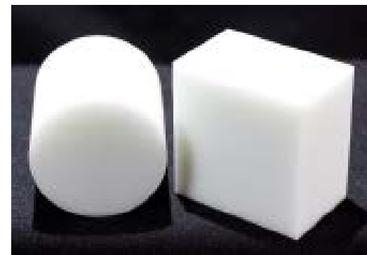
Rectangular and cylindrical Biomimic™ optical phantom