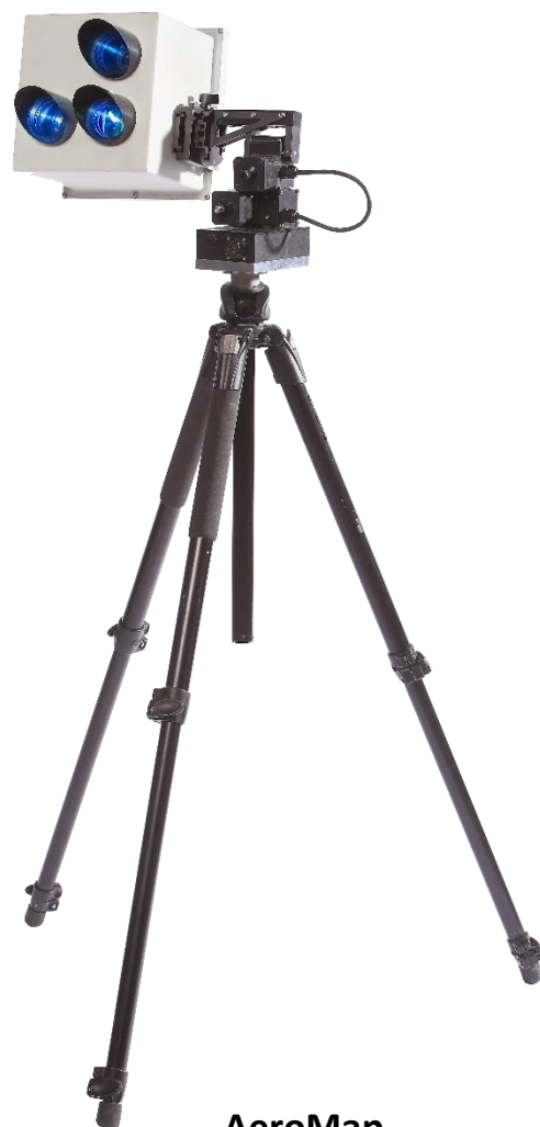
AeroMap NIR Full Waveform LIDAR